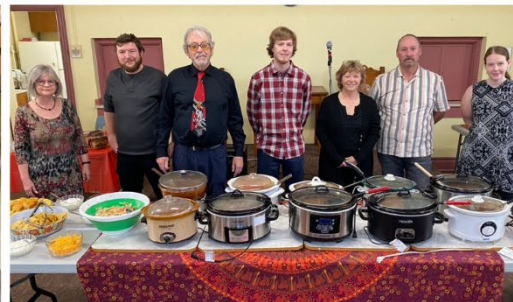
Clockwise from top left: The choir performs before the Chili Cookoff, one of our teen congregants sets up the livestream, the Chili Cookoff crew, Soup Kitchen helpers.