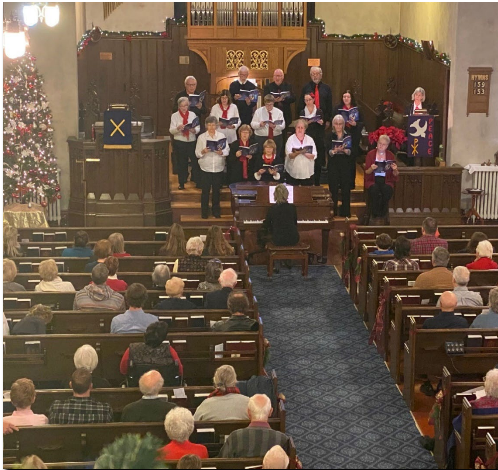
St. Andrew's Christmas Cantata, 2024