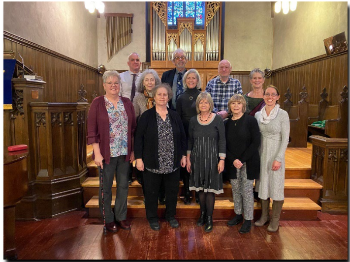
Pastoral Care Committee

St. Andrew's has a Pastoral Care Committee composed of a dedicated group of church members who devote many hours to addressing the pastoral needs of the congregation and the broader community when needed. The committee meets once a month and strives to be the proactive eyes and ears of the church, identifying those in need of visitation, prayers, or other support. The committee utilizes visits, phone calls, cards, and various other innovative approaches to serve the community, and are in regular contact with members who are unable to attend church.