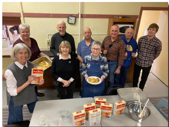
St. Andrew's Pancake Supper volunteers (2025).