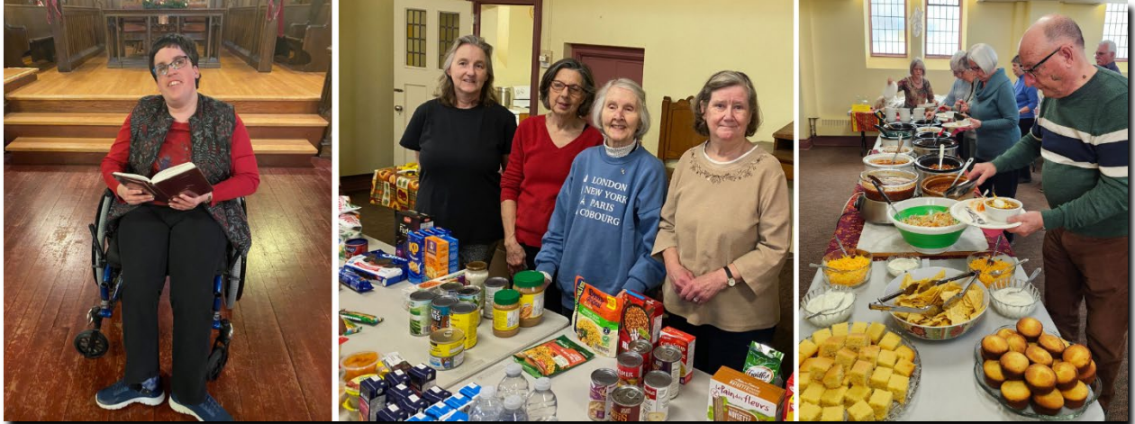
(Left) A congregant service reader. (Centre) The Fare Share table at the Soup Kitchen. (Right) The annual Chili Competition luncheon is enjoyed by many.

Through offerings St. Andrew's supports Presbyterians Sharing, the national church fund that supports the mission and ministries in Canada and around the world.