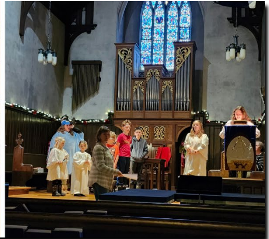
(Left) The Chimes music group performs. (Right) Children participate in the Christmas Eve service rehearsal.