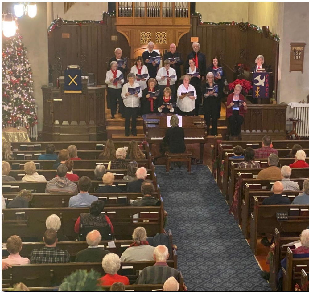
St. Andrew's Christmas Cantata, 2024