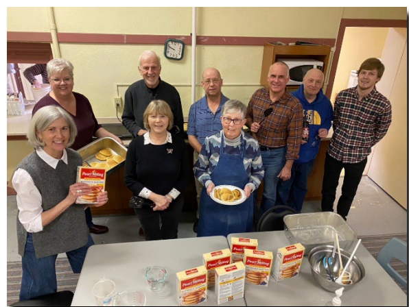
St. Andrew's Pancake Supper volunteers (2025).