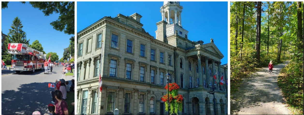
(Left) Canada Day parade along King Street in front of the church. (Centre) The Town's historic Victoria Hall. (Right) There are many walking trails in the nearby Northumberland Forest.