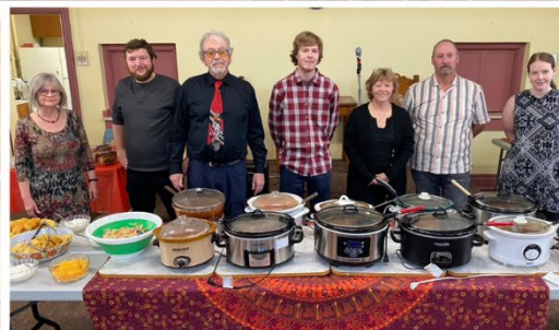
Clockwise from top left: The choir performs before the Chili Cookoff, one of our teen congregants sets up the livestream, the Chili Cookoff crew, Soup Kitchen helpers.