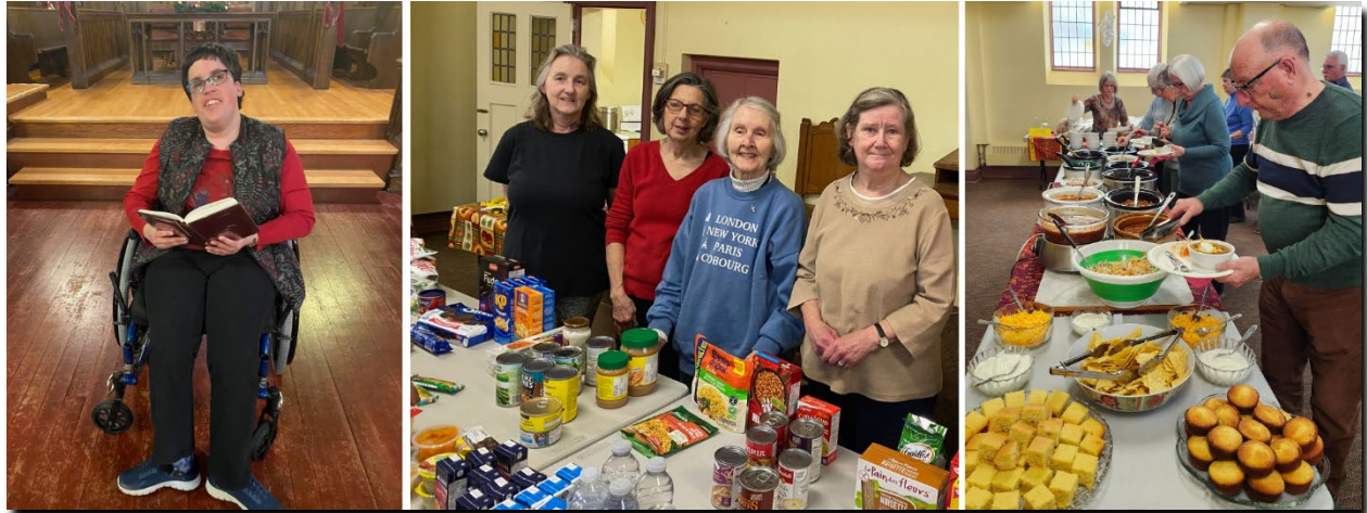
(Left) A congregant service reader. (Centre) The Fare Share table at the Soup Kitchen. (Right) The annual Chili Competition luncheon is enjoyed by many.

Through offerings St. Andrew's supports Presbyterians Sharing, the national church fund that supports the mission and ministries in Canada and around the world.