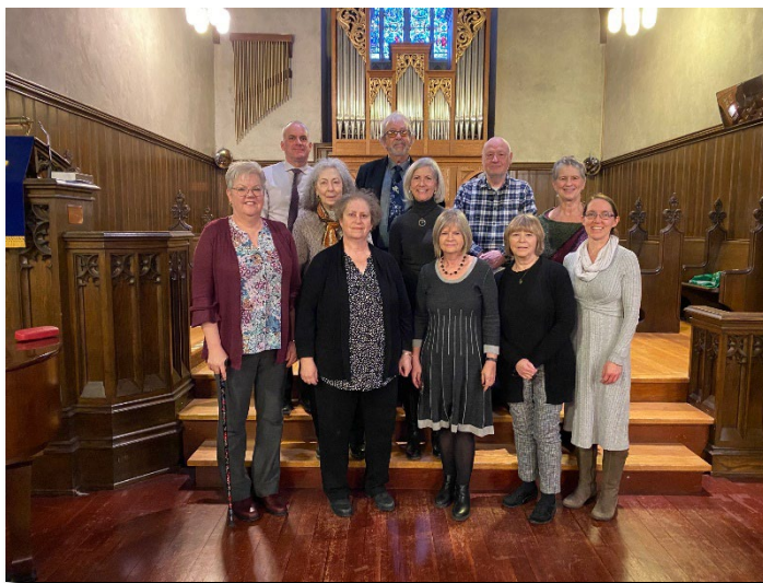
Pastoral Care Committee

St. Andrew's has a Pastoral Care Committee composed of a dedicated group of church members who devote many hours to addressing the pastoral needs of the congregation and the broader community when needed. The committee meets once a month and strives to be the proactive eyes and ears of the church, identifying those in need of visitation, prayers, or other support. The committee utilizes visits, phone calls, cards, and various other innovative approaches to serve the community, and are in regular contact with members who are unable to attend church.