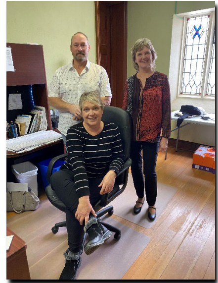
St. Andrew's current staff members.

Length of study leave: 2 weeks – accumulated up to 5 years