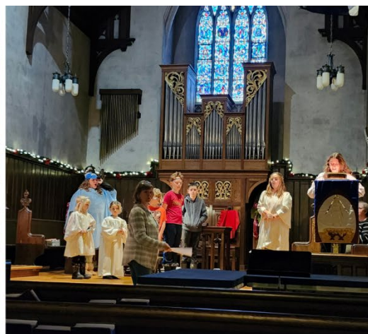
(Left) The Chimes music group performs. (Right) Children participate in the Christmas Eve service rehearsal.